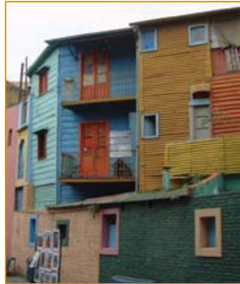
La Boca, Buenos Aires